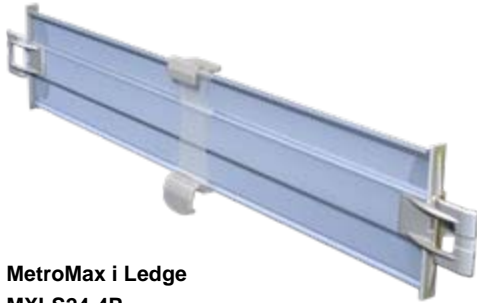
MetroMax i Ledge MXLS24-4P

Clean with mild detergents and solvents. Not recommended for use with quaternary ammonia.