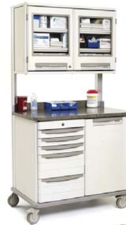
Double-wide Mobile WorkCenter with Laminate Countertop