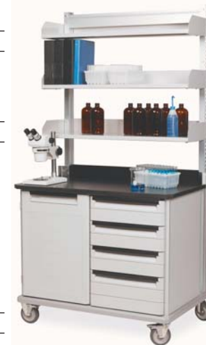
Mobile WorkCenter with Reagent Shelving

5" (127mm) Swivel/Lock (Directional) Casters (available by request) Other specialty caster options are available, consult your Metro representative.