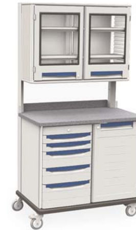
Model # SXRDEnt2 with SXRDOH27P Overhead, (2) SXRDOHPS Shelves and Clear Locking Doors

* Triple-wide overhead cabinets are only offered as part of Mobile WorkCenter offering. Contact your Metro representative for more information.