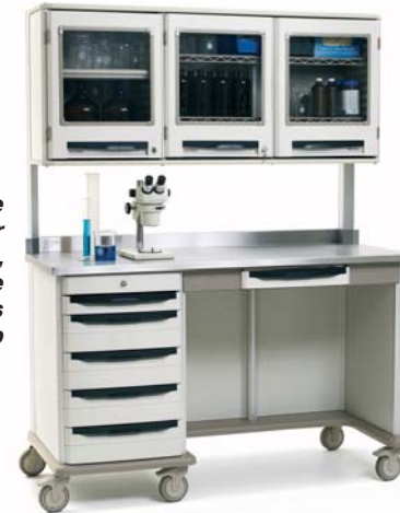
Triple-wide Mobile WorkCenter with Kneewell, Overhead Storage and Stainless Steel Top