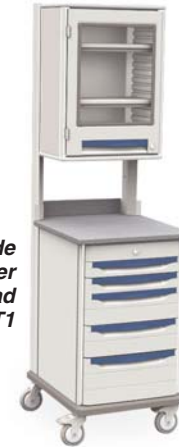
Single-wide Mobile WorkCenter with Overhead Cat. No. SXSENT1